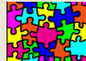
All the pieces fit in an orderly structure that is supportive.,