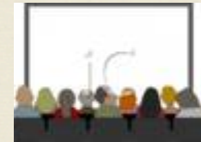
Participating in large assemblies