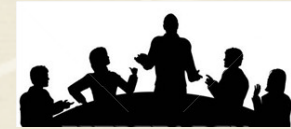
Leading small groups..

American Institute of Parliamentarians: www.parliamentaryprocedure.org