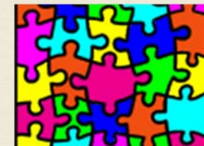
All the pieces fit in an orderly structure that is supportive.,